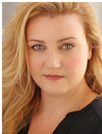
Meredith Holzman (Kristine) Broadway: Death of a Salesman TV: “Only Murders in the Building,” “Ramy,” “Chicago Fire,” “VEEP.”